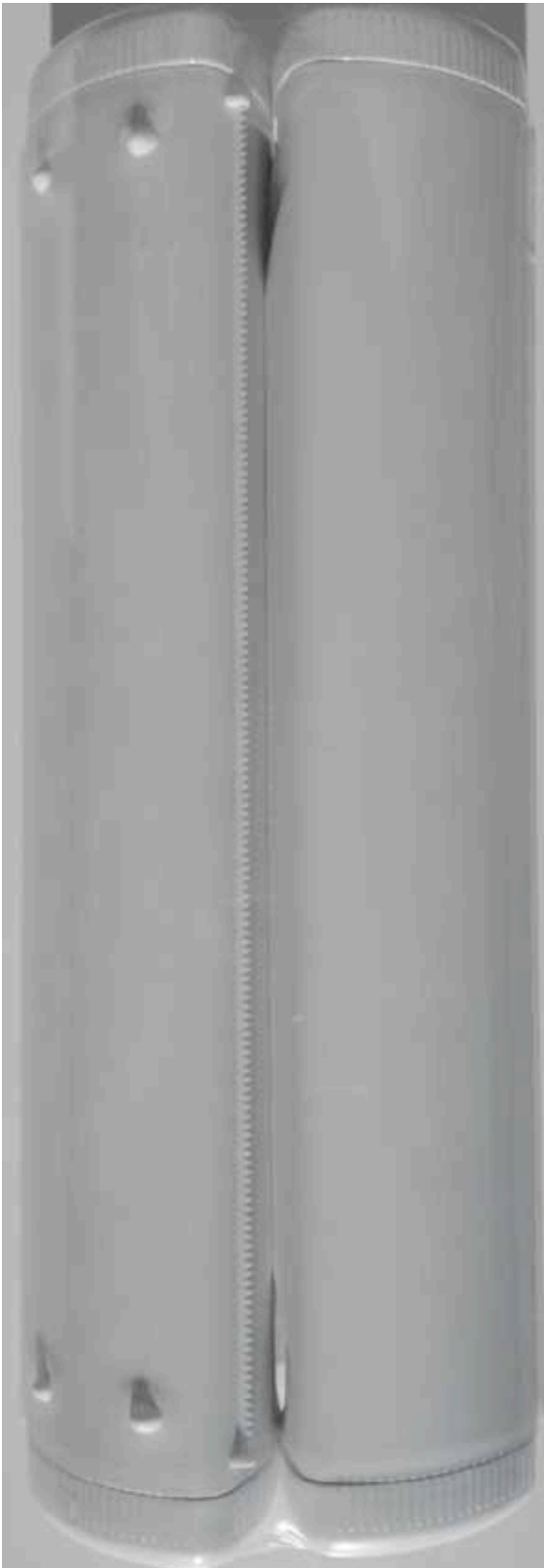
2 PCS.-SET SHRINKED